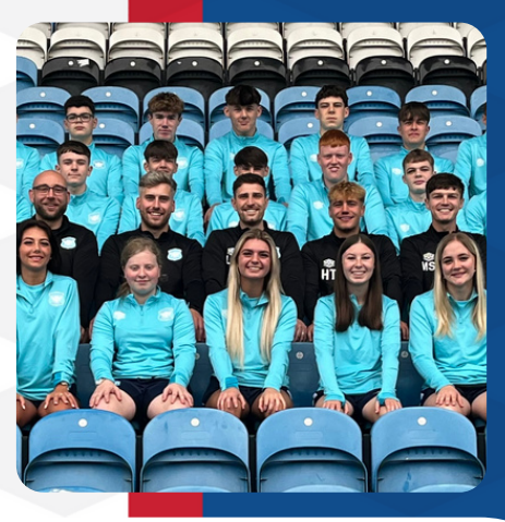
JAMES TOSE COMMUNITY SPORTS TRUST