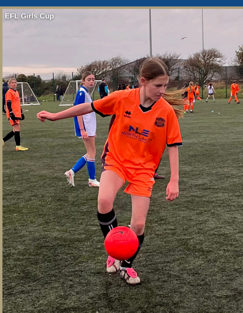
EFL Girls Cup