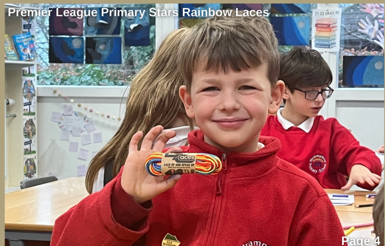
Premier League Primary Stars Rainbow Laces