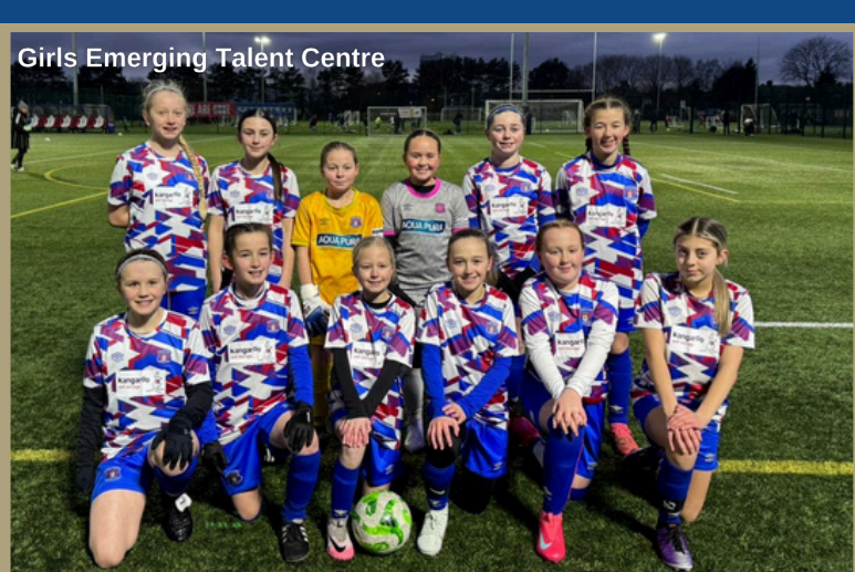
Girls Emerging Talent Centre