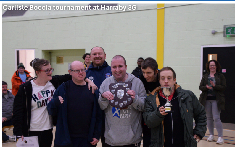
Carlisle Boccia tournament at Harraby 3G

Finally , we were hugely honoured to be invited down to present awards at the annual Carlisle Boccia tournament at Harraby 3G in late April. It was excellent to see so much positivity from all of the competitors. A huge well done to everybody who took part and congratulations to all of the winners.