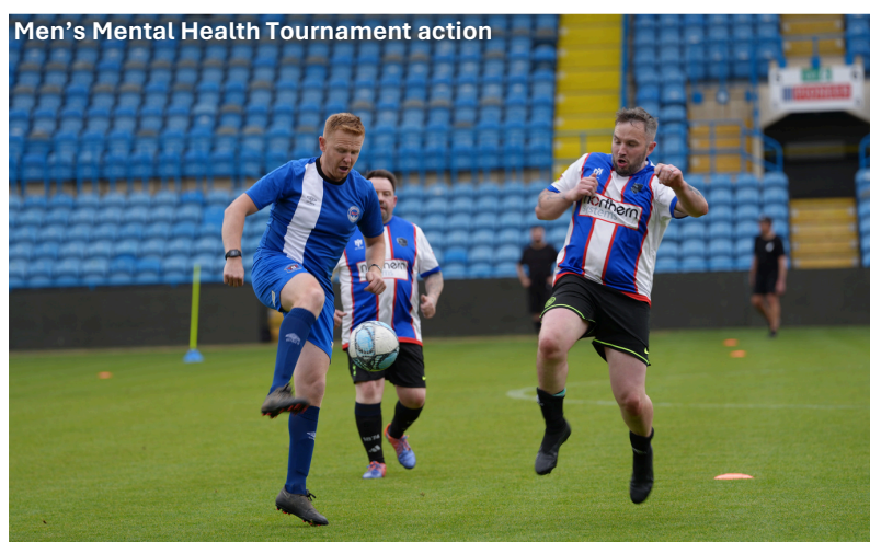
Men’s Mental Health Tournament action