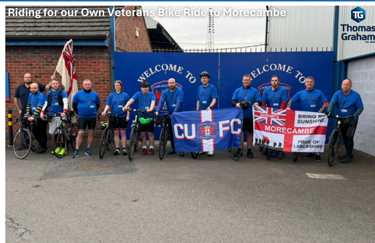
Riding for our Own Veterans Bike Ride to Morecambe