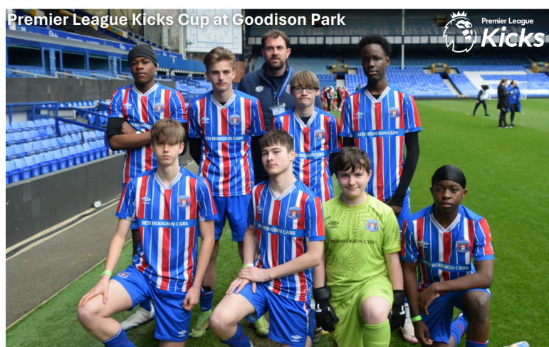
Premier League Kicks Cup at Goodison Park