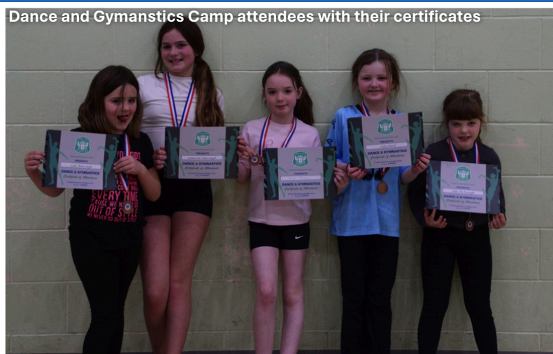
Dance and Gymnastics Camp attendees with their certificates