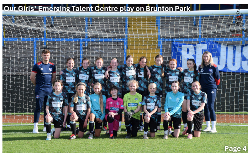
Our Girls' Emerging Talent Centre play on Brunton Park