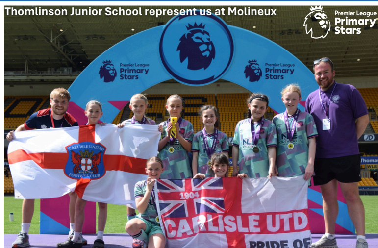
Thomlinson Junior School represent us at Molineux

We also hosted three days of football at Brunton Park as part of our Premier League Primary Stars Football Festivals. It was amazing to see over 700 local pupils have the chance to play on the pitch over the course of the three days.