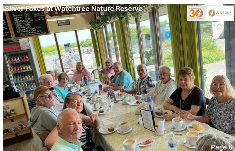
Silver Foxes at Watchtree Nature Reserve